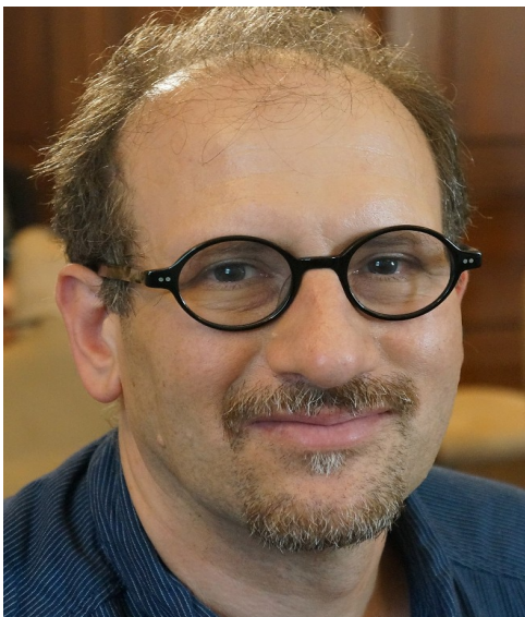
David Grinspoon (c) https://images.app.goo.gl/6WgmWy7XjfiBBn4N9