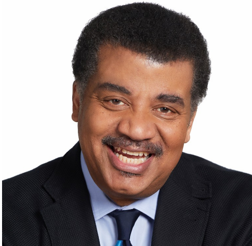
Neil deGrasse Tyson