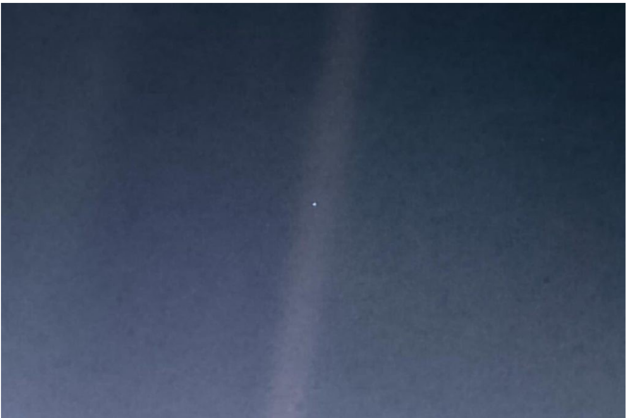
Illustration 2: https://lowell.edu/astroalert-nasa-remasters-the-pale-blue-dot-photo-of-earth/

Sagan showed a photo of our planet, taken from a camera on the Voyager 1 spacecraft, then at the edge of the solar system – the heliopausa: