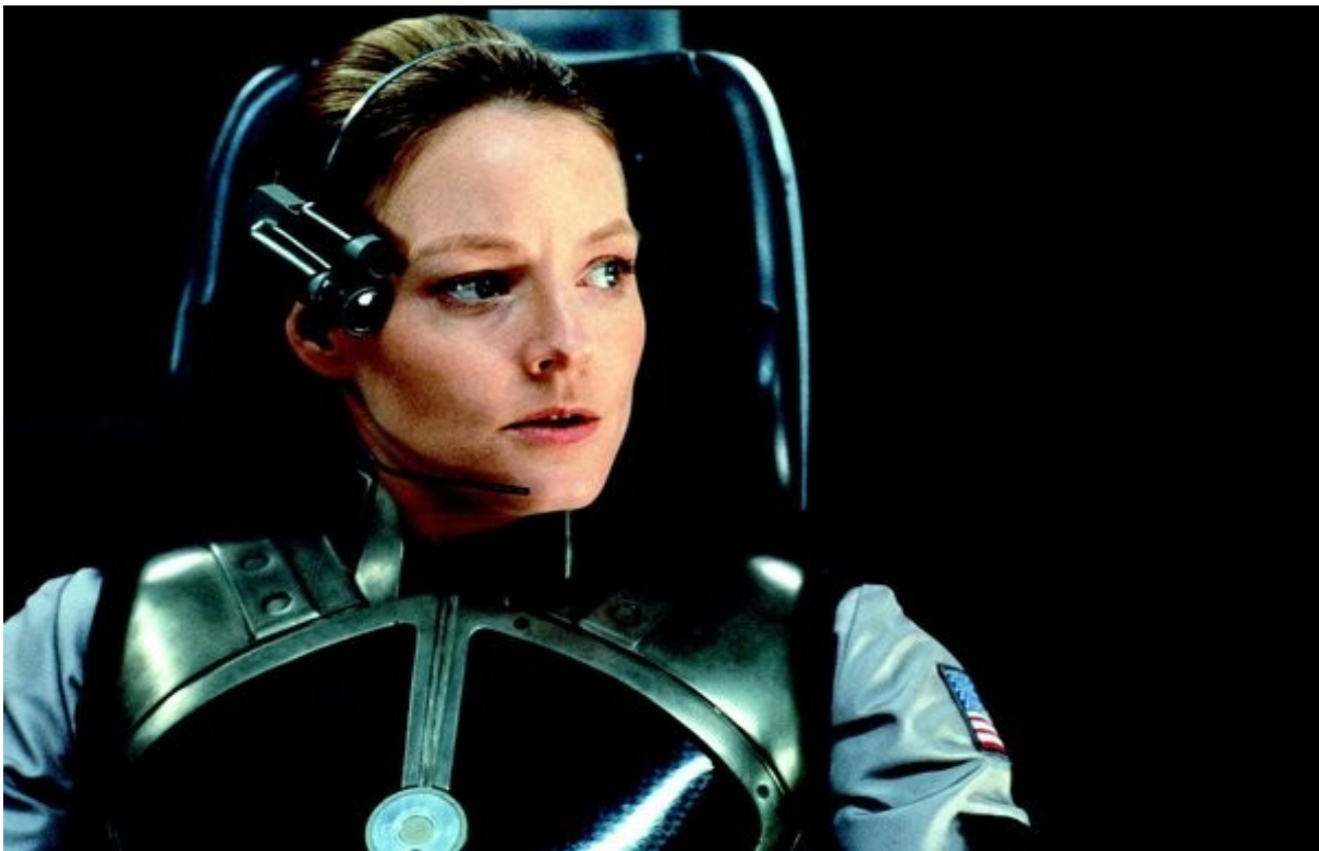
Illustration 1: Jodie Foster as Dr. Eleanor Arroway - "Contact" - 1994.

popularizer, environmental activist, anti-nuclear activist, disarmamentist (and was even arrested due to protests in Nevada – by the way, the same misadventure as the famous philosopher Bertrand Russell in UK). He was a supporter of the "kick weapons out of space" movement. Dr. Sagan has written more than 600 scientific publications and more than twenty popular books (including "Cosmos" and "Dragons of Eden") and science fiction (including "Contact", which was turned into a film, starring Jodie Foster).