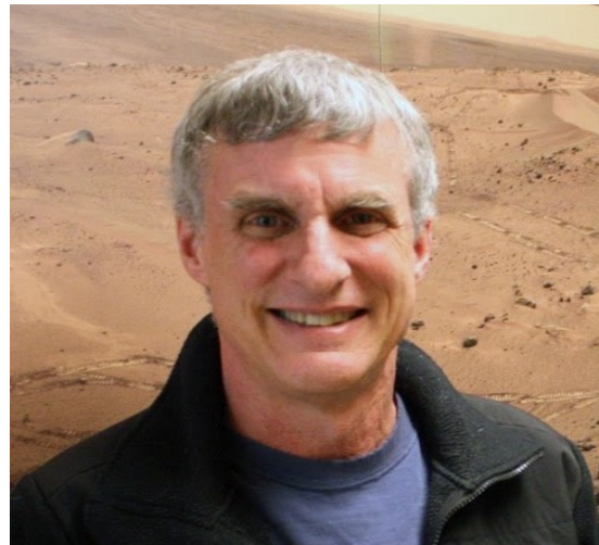
Steve Squyres (c) https://images.app.goo.gl/EtevHBqcCzdUT2Wh8